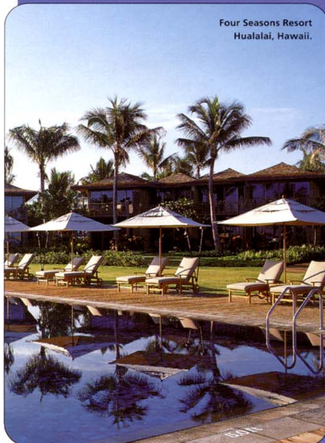
Four Seasons Resort Hualalai, Hawaii.